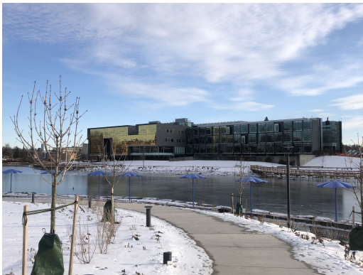
A wintery PI in front of the frozen Silver lake.

and passion for the subject matter itself and the conceptual or analytical tools employed. The combination of an overarching goal within their specific research community – be it quantizing gravity, explaining dark matter etc. – together with honestly finding enjoyment in the day-to-day business of working through lengthy derivations or digging through code is why they are here. Plus the warm-hearted environment that PI is rightly proud of :)