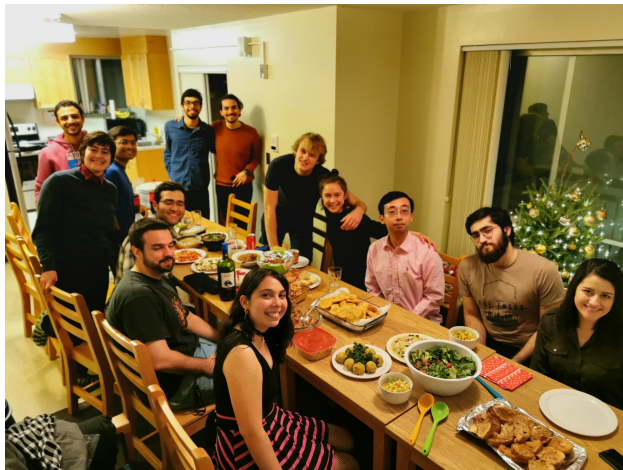
A very special Xmas together in Waterloo ☺