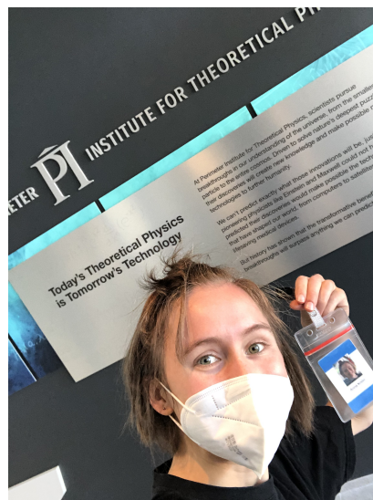
“Today’s theoretical physics is tomorrow’s technology” : PI’s slogan next to the entrance door

I think most researchers at PI would state that they do what they do thanks to curiosity