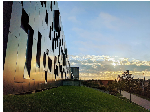
A close-up of PI in fall ... credits to fellow PSI on Zheng & his photography skills <3