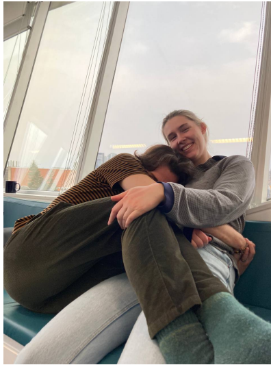
Cuddle-time \heartsuit during the PhD application frenzy

(QMC) algorithm into QuEra's open source platform Bloqade . Further, I promoted the company's technology in my first public physics talk . Stay tuned for more details in an upcoming article on Perimeter's homepage :)