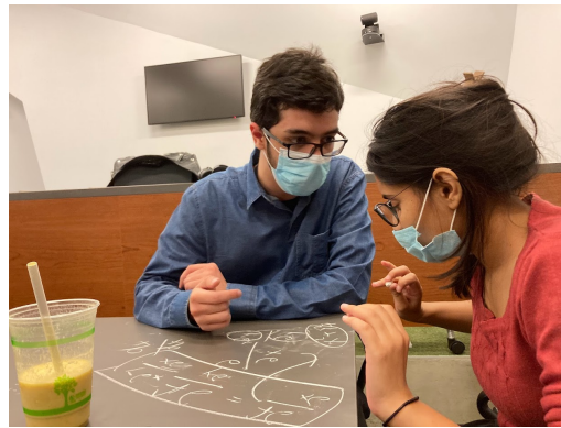
Tables = blackboards