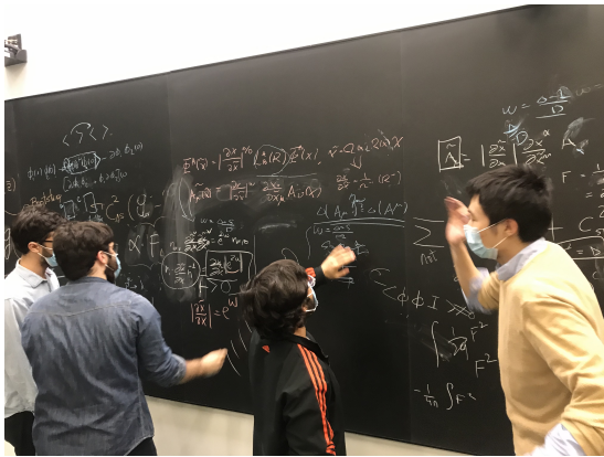
Walls = blackboards